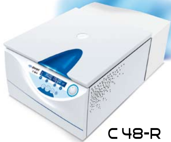
C 48-R Refrigerated