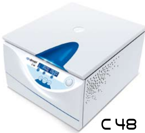
C 48 Ventilated